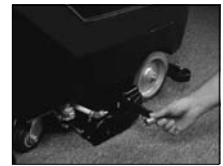
Quick disconnect spray bar slides out easily.