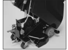
Hinged body allows access to internal components.