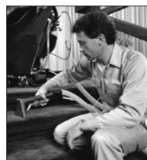
Hand tools and hoses are available for stairs and upholstery.