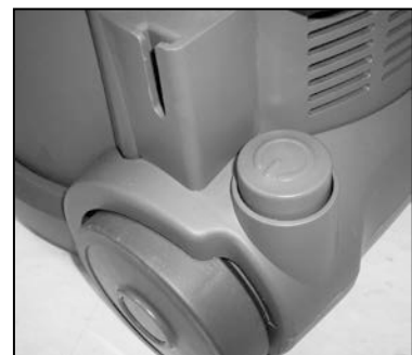
A step switch at the base of the machine allows hands-free on/off operation.