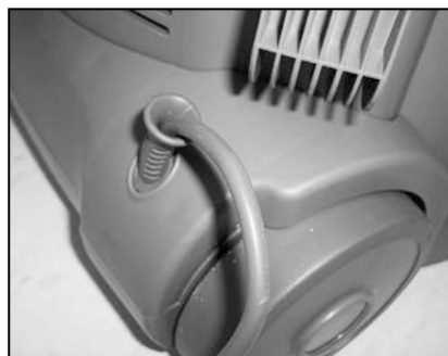
A rigid cord strain relief helps prevent pull-out damage to the cord.