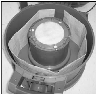
A paper filter bag inside the tank encircles the vacuum motor. Optional cloth bag is available.